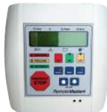
Display Master 4 - Remote Addon Panel with Remote Master Built in