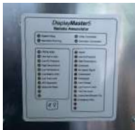
Display Master 5 29 Light Remote Addon Panel